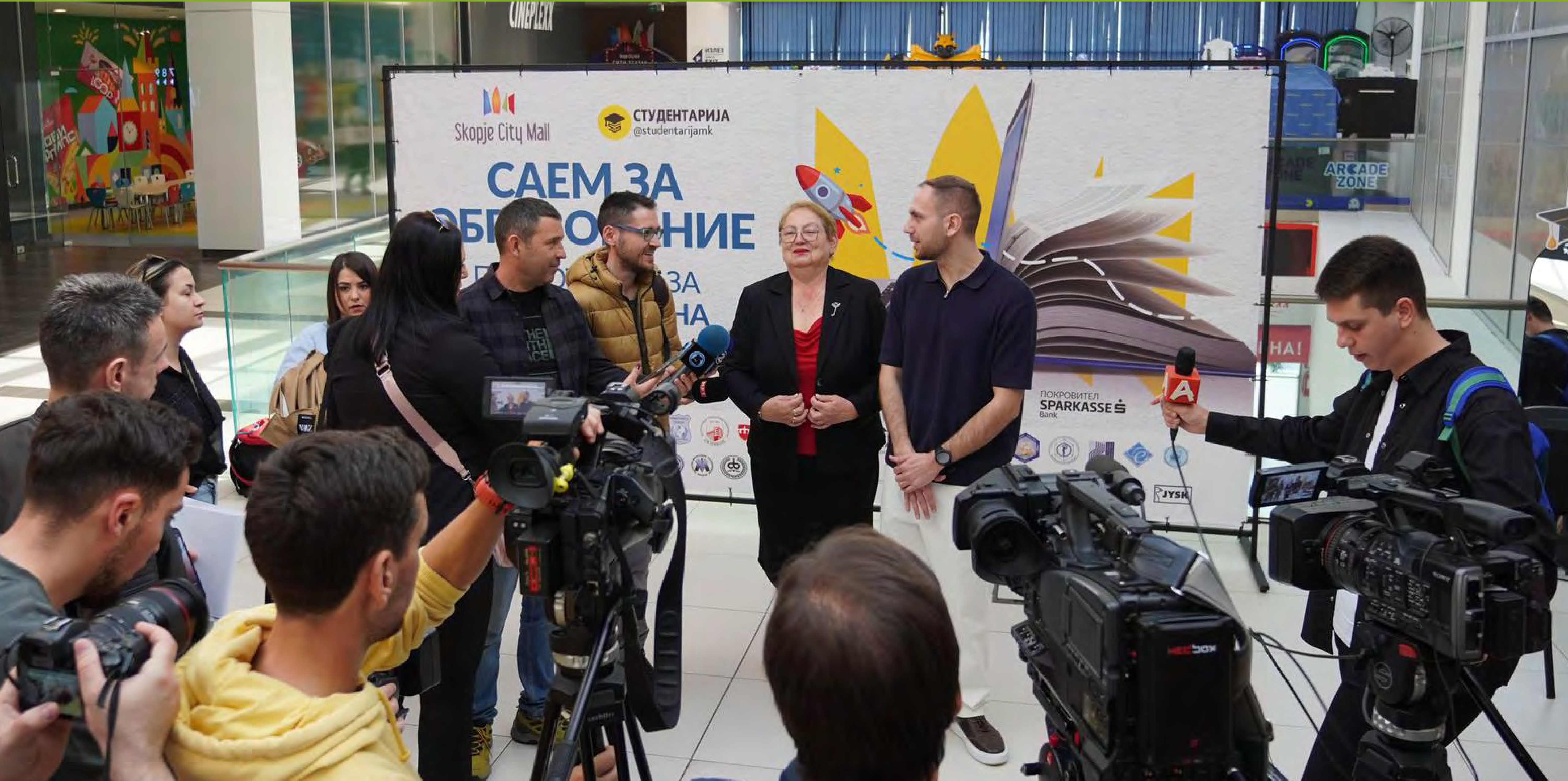
Photo from the Education Fair held on March 15, 2025 CE