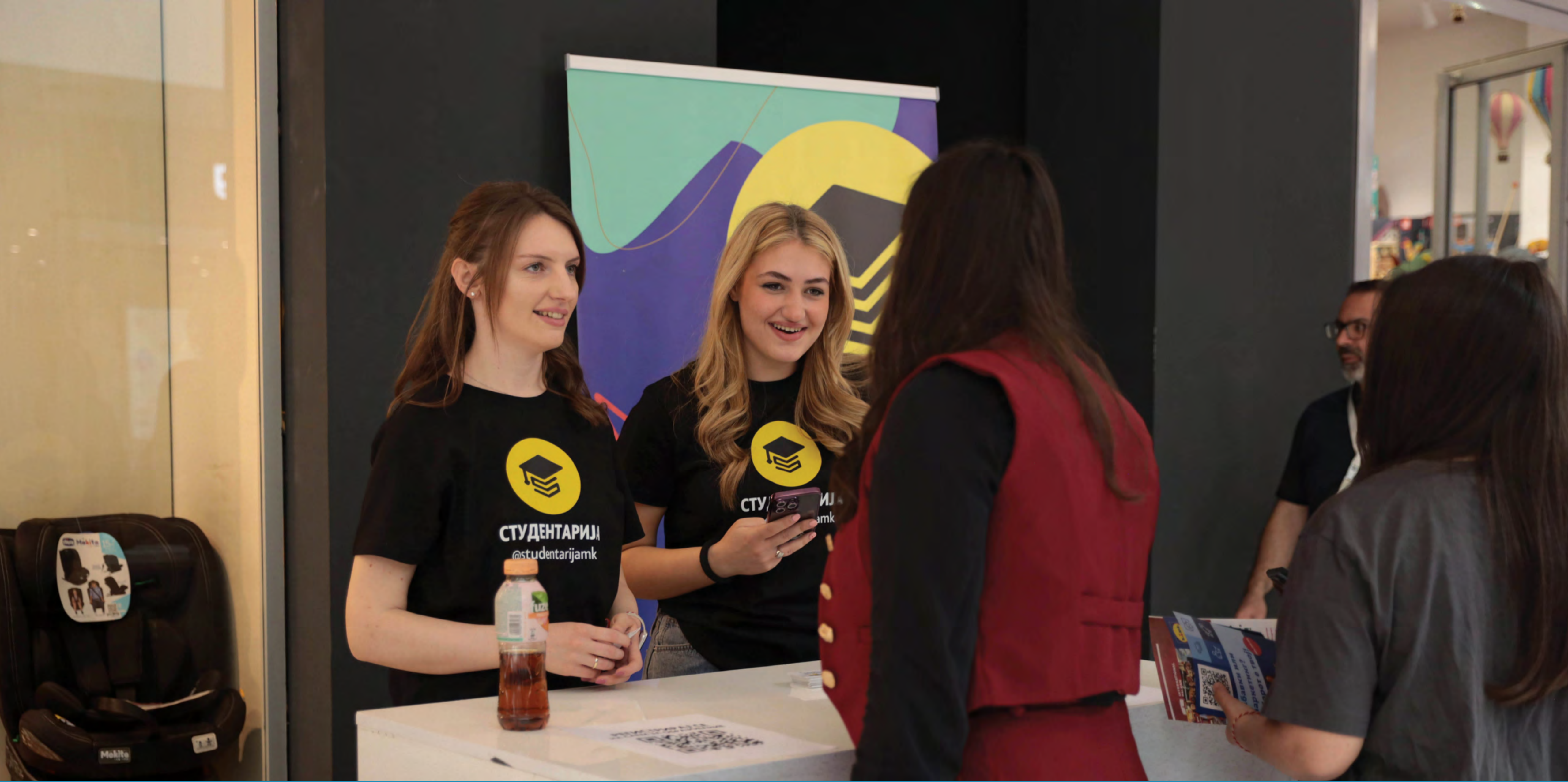
Photo from the Education Fair held on March 15, 2025 CE