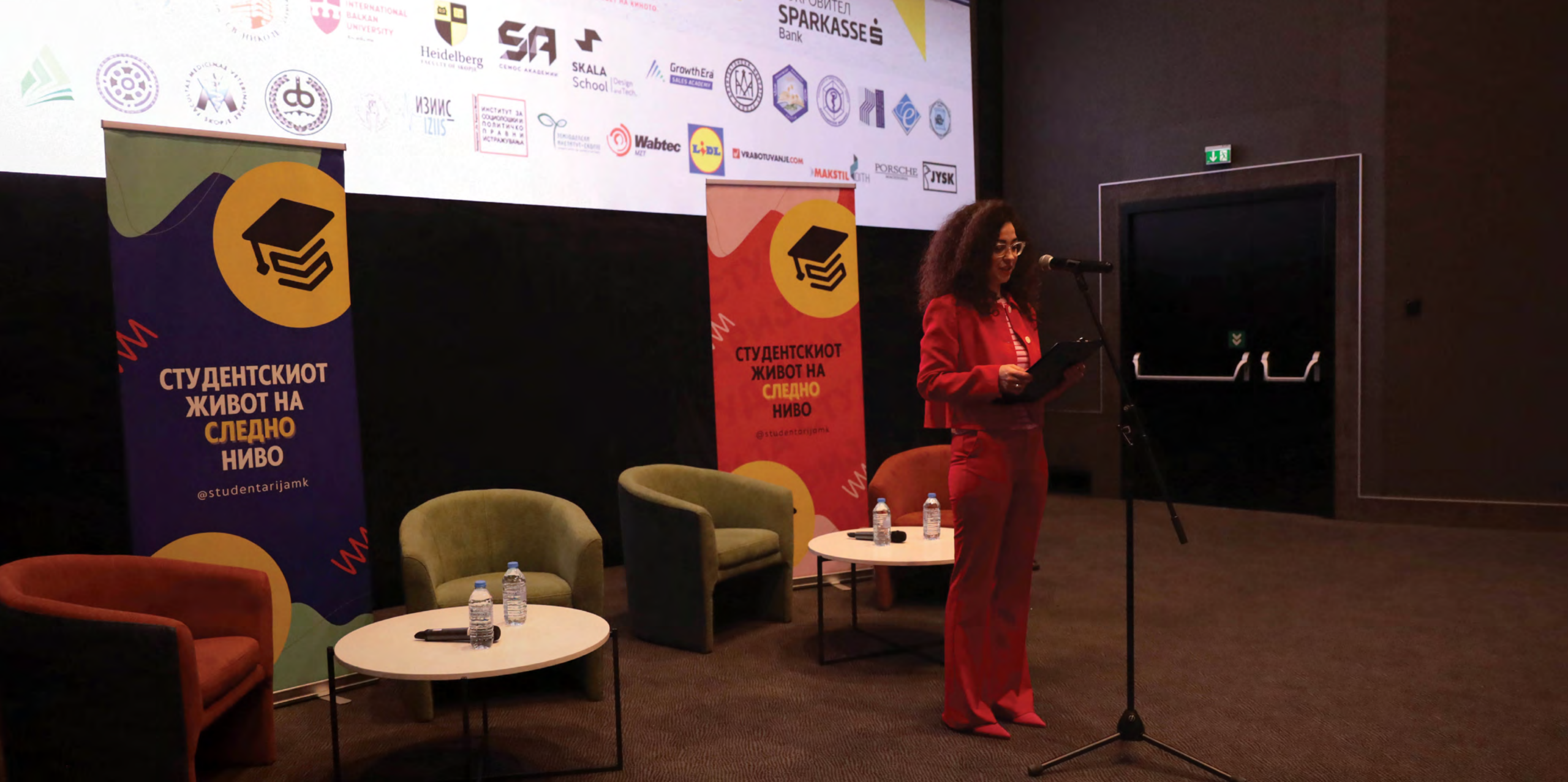
Photo from the Education Fair held on March 15, 2025 CE