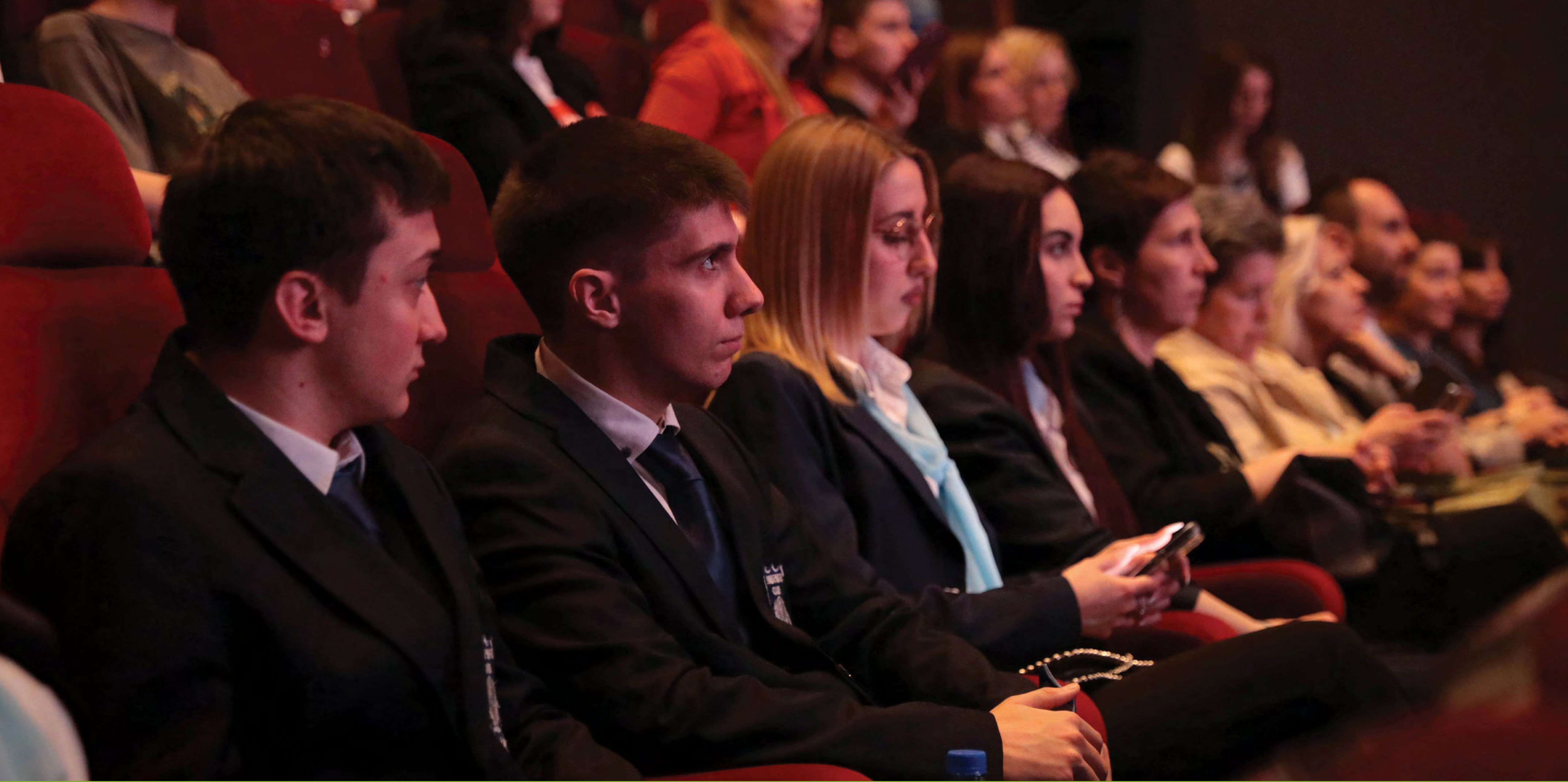
Photo from the Education Fair held on March 15, 2025 CE